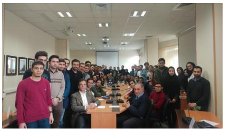
TA training workshop, February 27, 2019