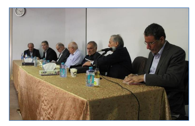
5May, 2018 meeting

The Chair-holder was invited as guest speaker to the roundtable meeting on Necessity and Methodology of development in curriculum of undergraduate Chemical Engineering, in Amir-Kabir University, Tehran, Iran (21 January, 2019).