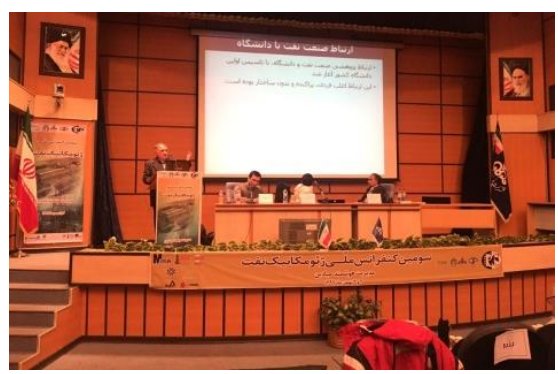
22 January, 2019

As a keynote Speaker, the Chair-holder gave a lecture on Challenges of Industry-University Collaborations, in the 3<sup>rd</sup> National Conference on Petroleum Geo-mechanics (22 January, 2019).