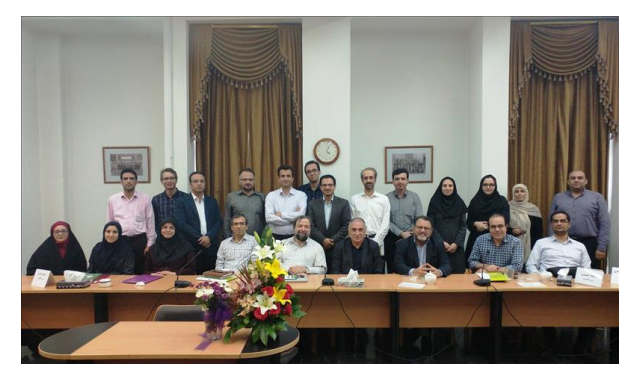
Four days faculty development educational course, June 2018

4 days educational course of "professional development", for faculty members of the College of Engineering and members of some other universities, University of Tehran (June 23-26, 2018).