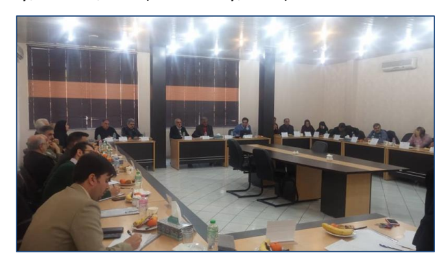
21 January 2019 meeting

The Chair-holder was invited as guest speaker to the roundtable meeting on Necessity and Methodology of development in curriculum of undergraduate Chemical Engineering, in Amir-Kabir University, Tehran, Iran (21 January, 2019).